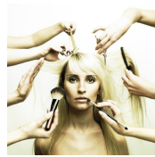
Change the shape of